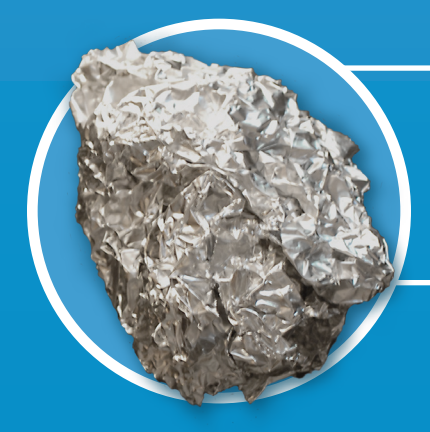
Tin Foil Without Food