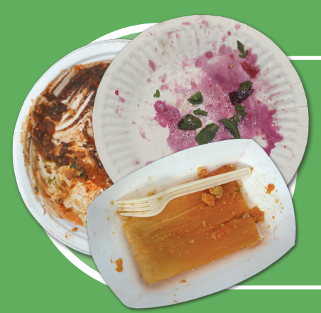
Soiled Paper Products (including compostable fork)