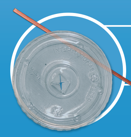
Plastic Cup Lids & Straws