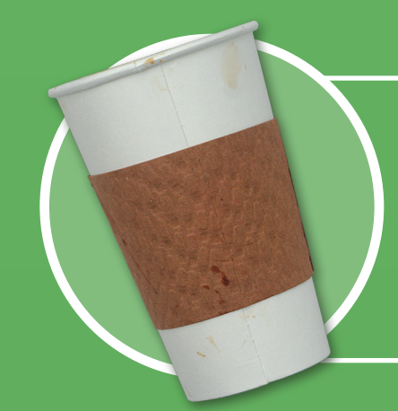
Paper Coffee Cups with sleeves NO LIDS!