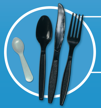
Plastic Utensils (NonCompostable)