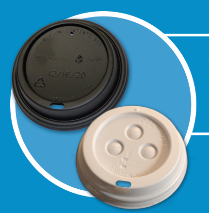
Coffee Cup Lids (Black & White)