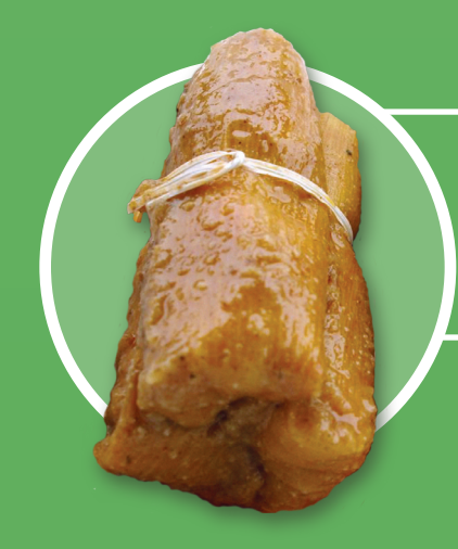
Unfinished Food Scraps