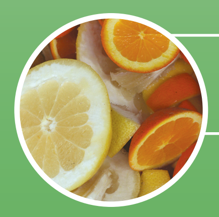
Fruit and Vegetable Scraps